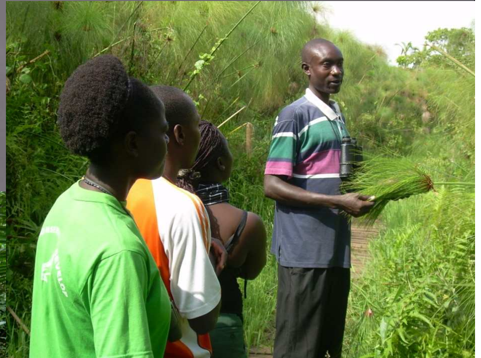
A center for guide training