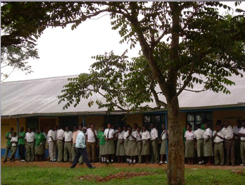
Founded Bigodi SS with over 300, promoting girl-child and conservation education