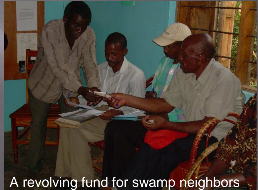
A revolving fund for swamp neighbors