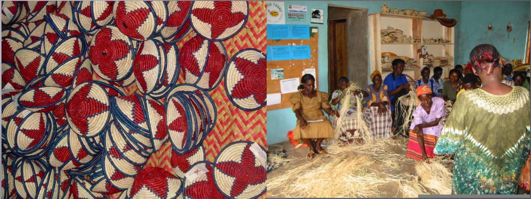
Crafts prepared for a specific market ready for export