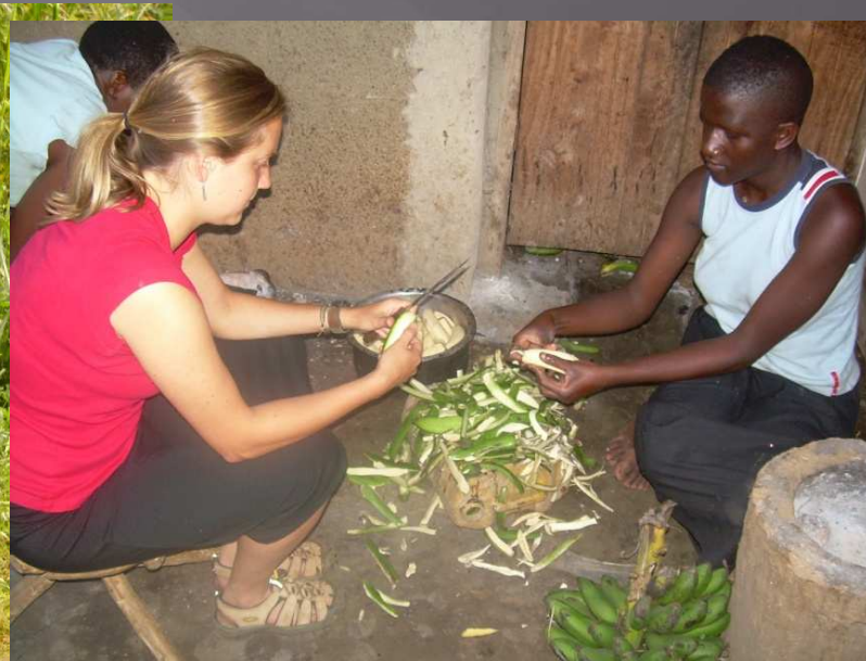
Home-stays and Traditional lunches