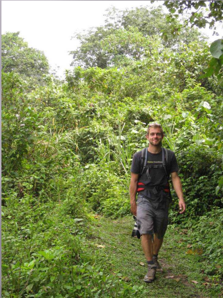
Nature and Village Walks