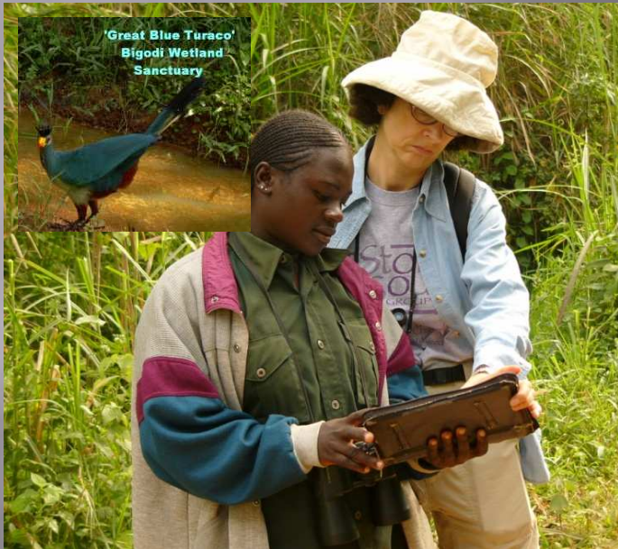
Bird watching hotspot with over 200 Identified species