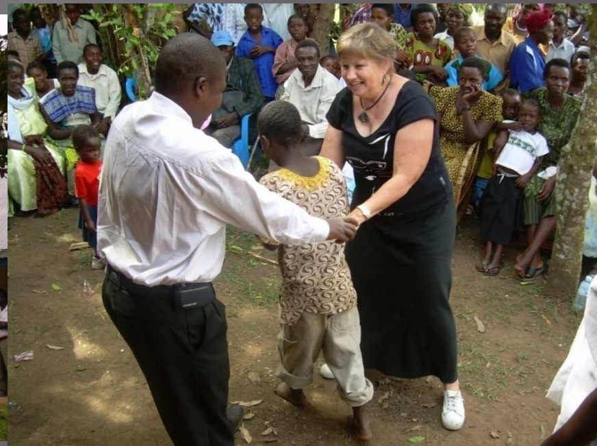
Conservation education programs in schools and the community