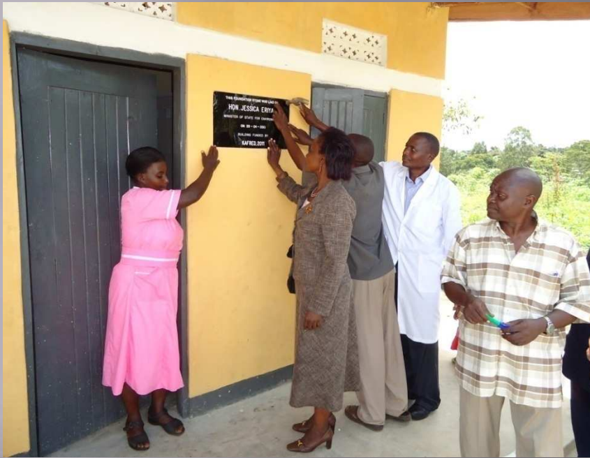
Built a house for mid-wives at Health Centre