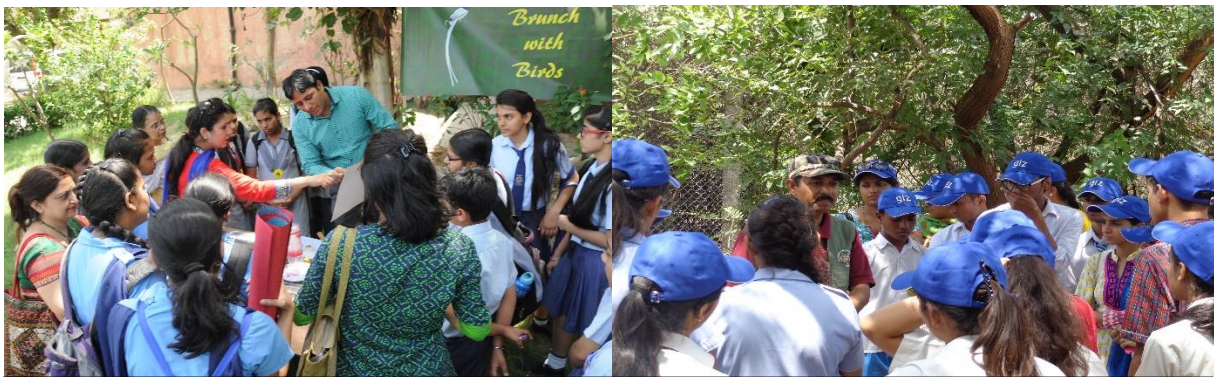
Tryst with nature: students and teachers on nature trail

The Indo-German Biodiversity Programme in collaboration with the Department of Environment & Forests, Govt. of NCT of Delhi organised a half day event with school and college students at the Asola Wildlife Sanctuary, located along the northern terminal of Aravalli Hills, one of the oldest mountain system of the world. A verdant green protected area in the southern-most part of Delhi boasts of diverse species of animals, birds, butterflies and natural flora. The sanctuary also has a conservation education center, runs in partnership with the Bombay Natural History Society (BNHS) with excellent interpretative material.