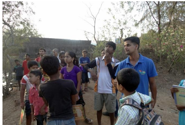
Nature walk with school children of Velas village

This year, Biodiversity Day was celebrated at all the pilot sites in Maharashtra, and saw active participation from the local population. The Mangrove Cell of the Forest Department organised all events. At Velas, school children were taken for a nature walk by the local Forest Department coordinator who explained the benefits of the indigenous flora. The coordinator also helped the children to identify several birds that thrive on the rich natural mangroves along the coast. The children then participated in a drawing competition, on the topic "What I love about Nature", held on Velas beach, under the shade of swaying casuarina trees. This was followed by a screening of the film 'Biodiversity for Sustainable Development' and interactive discussions.