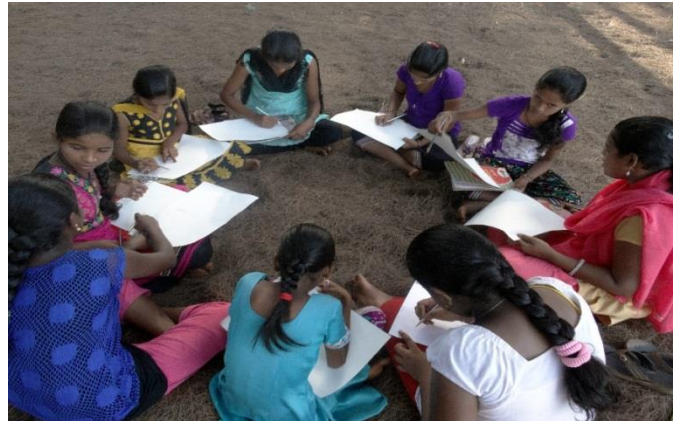
Young girls engrossed in bringing their ideas to life on paper

A drawing competition and a film screening were held at Ansure village. School children also attended a dialogue on the mangrove ecosystem, the flagship species in the area, sustainable use of biodiversity and its importance for the village.