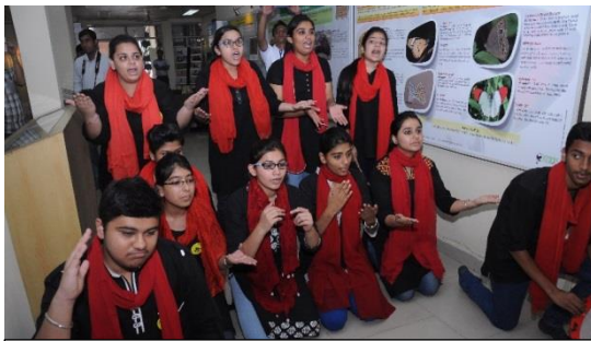
Students performing enthralling street play on nature and biodiversity

The Deputy CM also enjoyed taking a view of the colourful display of the poster competition entries and appreciated the students for their creativity and talent. He was also enchanted by the impressive performance of streetplay/nukkad natak by the students. The half day event was successful in its endeavor to propagate conservation of biodiversity on the rightful International Day for Biological Diversity.