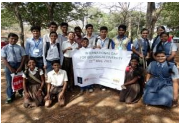
Tansa village school children all geared up for Biodiversity Day celebrations

The International Day for Biodiversity was celebrated at the creek along with school children from the neighbouring tribal village of Tansa, local community members and senior government officials from the Forest Department. The event was organised by the Forest department.