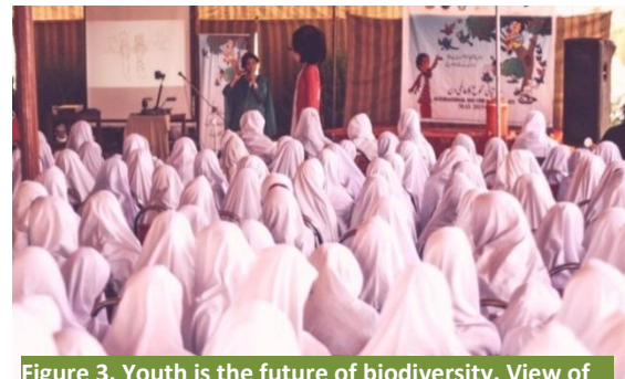
Figure 3. Youth is the future of biodiversity. View of International Day for Biodiversity celebration at Govt. girl's high school Zarkhela Shamoza Swat.

celebrate the Biodiversity Day. He said Biodiversity is the variety of different types of life found on earth and their ecosystem and is extremely important to people and for healthy ecosystems. "Swat valley is rich in biodiversity and there is a dire need to protect and conserve it, so each of you must convey this message to five other people to strengthen awareness on biodiversity" he added. During the events the experts emphasized to protect biodiversity for future generation of the country by adopting the practical measures i.e. reforestations with local forest plants, to control of pollution, conserve wildlife, and keep the environment clean from all kind of pollutions. Through showing animated videos the message was clearly conveyed to the students that biodiversity provides different services to the people especially to majority of the population in the rural areas in the form of food, clean water and air, medicines, and shelter.