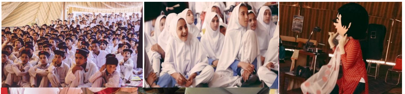
Figure 4. Happy faces of the students, enjoying the puppet show on International Biodiversity Day at Swat

A presentation on making cartoons was also delivered followed by a painting competition among the students. The students participated in the environmental games with the puppets and enjoyed the unique activity. The response from the students to the questions asked by the moderator and wildlife department experts on biodiversity were really encouraging indicated that the message was well received by students. At the end, story books, sketch books and other information materials on biodiversity and environment were distributed among the students. On the occasion the host took a pledge from the children that they would care about the environment, trees flora and fauna and would play their key role in conservation of biodiversity.