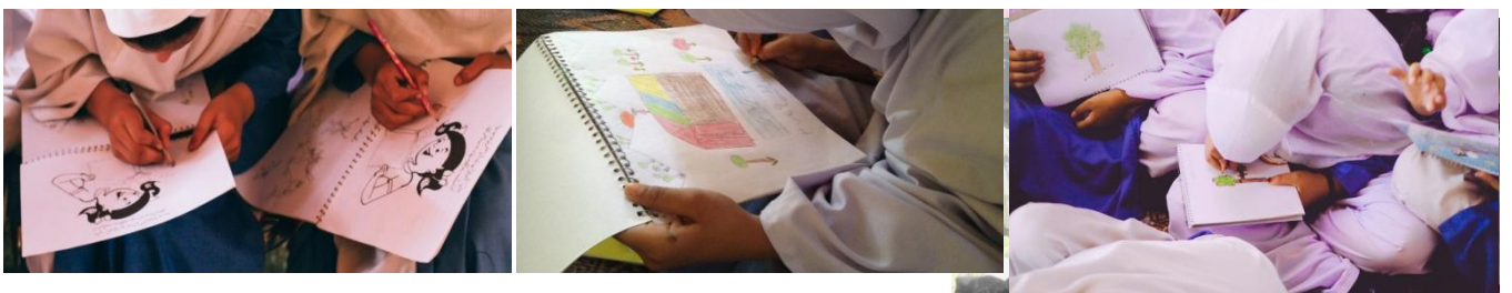
Figure 5. Students are participating in drawing competition