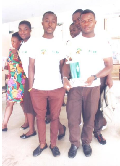
The first school ANYUNGUAH College