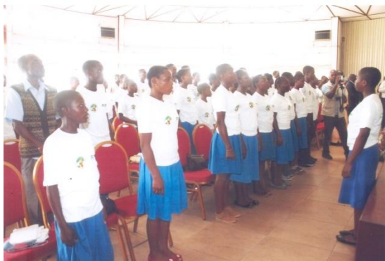
Students singing the National Anthem