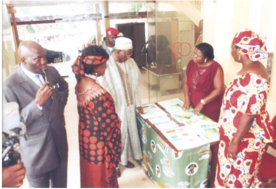
Stand for messages for Goal A,B and D of NBSAP II