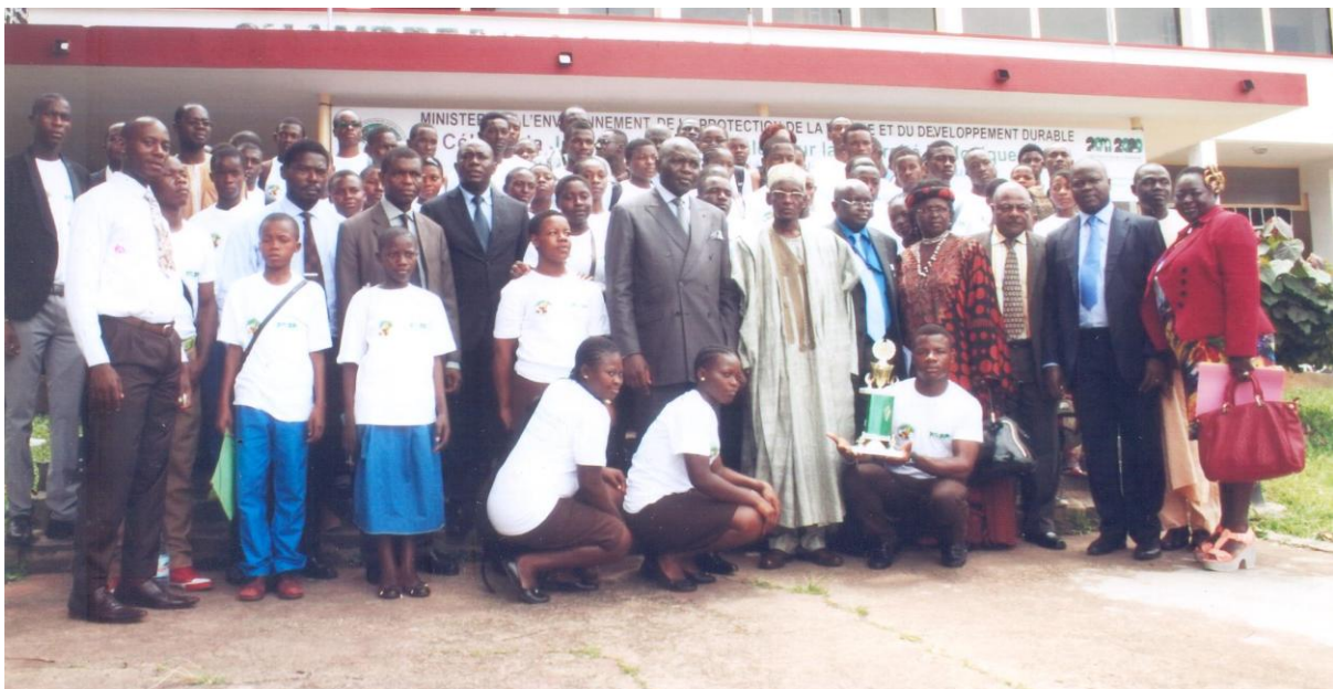
Group picture of the different participants

After the keynote address of the Minister Delegate to the Minister of Environment, Protection of Nature Sustainable Development, the participants led by the Minister Delegate, to the Minister of Environment, Protection of Nature and Sustainable Development proceeded to take the group picture, and this was closely followed by visitation of the exhibition stands.