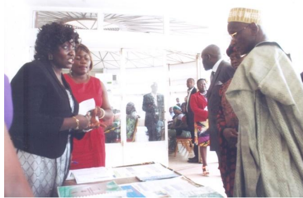
Stand for messages for Goal C and ecosystem specific targets of NBSAP II