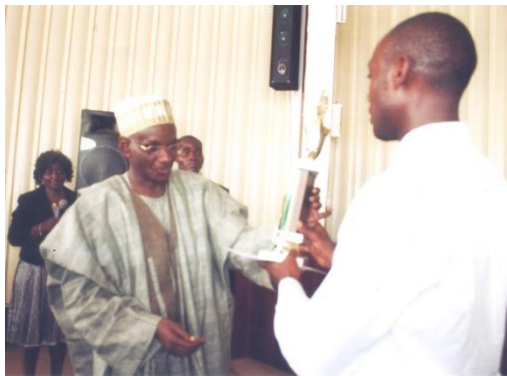
The First prize handed over by the Minister Delegate