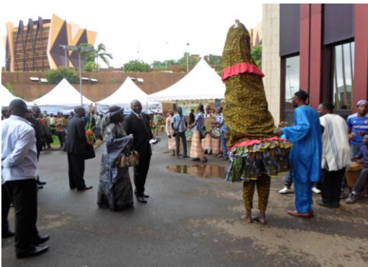
Masquerade of dance group from the North West