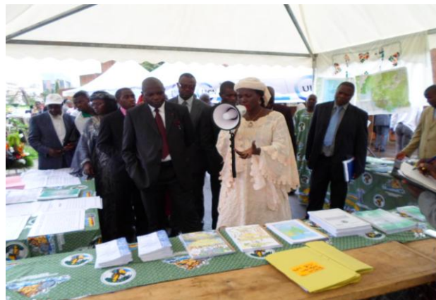
MINEPDED exhibition stand