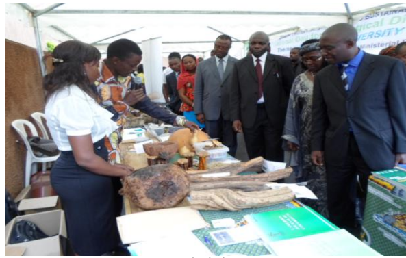
MEM exhibition stand