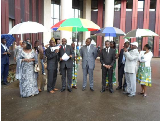
SG reads MINEPDED speech as rain drizzles.