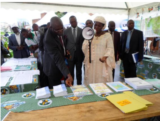
International agreements including the CBD