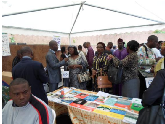
IUCN "Radio Environnement" interviews NFP along side visiting Senator Doh