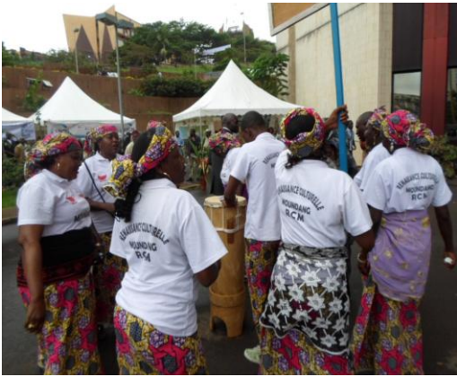
Traditional dance group from the northern region of Cameroon