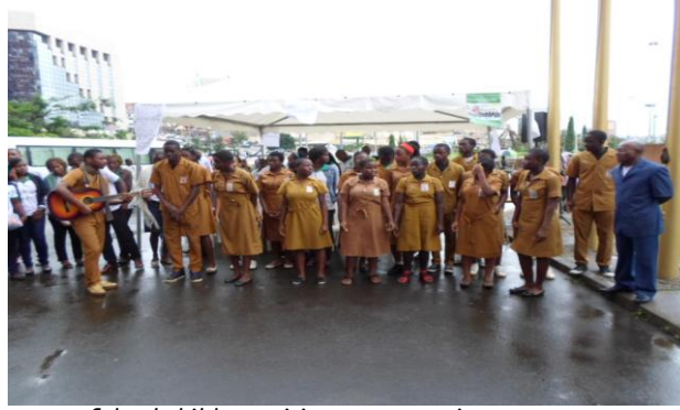
School children raising awareness in song

The exhibition came to a close at 4.00pm