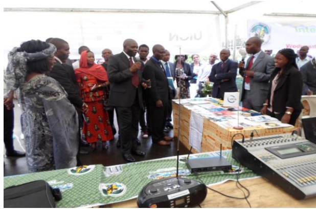
IUCN exhibition stand with the mobile "Radio Environnement"