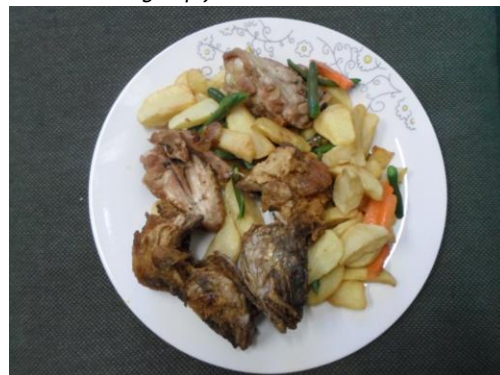
Enough for today and tomorrow?