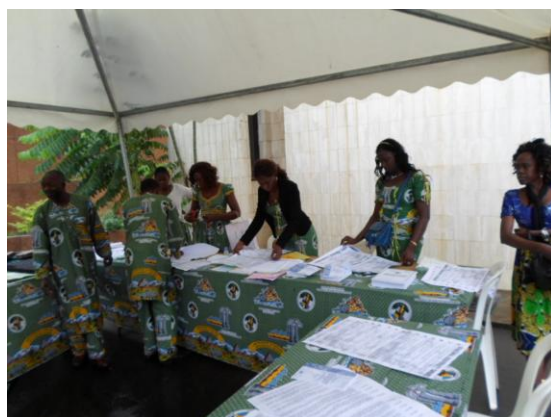
Setting up the MINEPDED stand