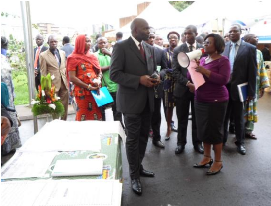
Introduction of exhibition ground to SG of MINEPDED