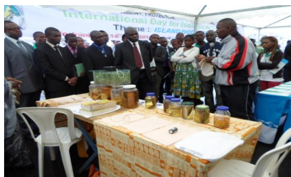
WFC Exhibition stand

The WFC presenter also informed participants that on the Lindema Island, there is pollution from palm oil waste which runs off from large palm plantations on the mainland. The whole island of Lindema is covered with this waste which has had serious adverse effects on aquatic biodiversity. He therefore pointed out the need for ways and means for managing wastes from palm oil factories on the mainland.