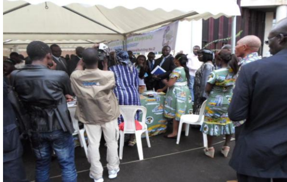
FVVO exhibition stand

Though uninvited, the representative of this non-governmental organisation proactively showed up at the exhibition ground just after learning of the occasion from the CRTV televised morning programme “Bonjour”, on the morning of the celebration. In her stand, she presented articles made largely by the women from biodiversity resources, for economic improvement and sustainable livelihood. The articles included raffia trays, dish and glass stands, and baskets to replace the use of the recently banned plastic containers.