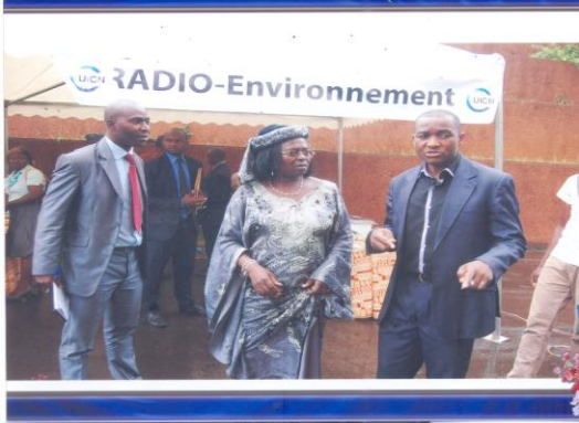
The NFP overseeing the exhibition stands