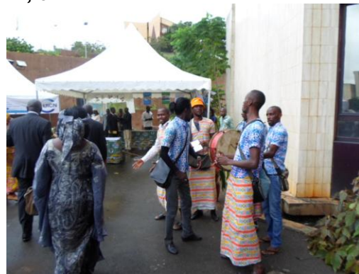
Dance group from Littoral