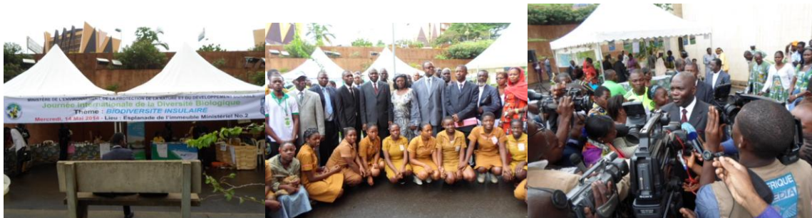
A cross-section of the exhibition ground including school children and the media