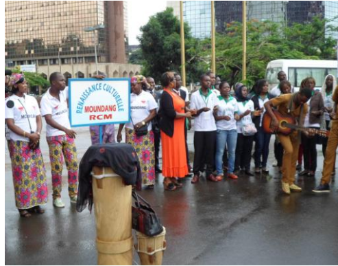
School children & a dance group