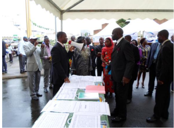
Policy documents including NBSAP- MINEPDED stand