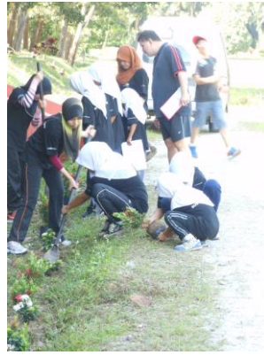
Participants planting local species tree seedlings