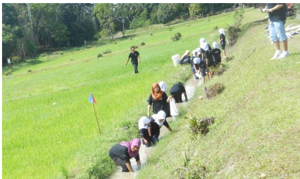
Identifying local fish species in paddy field