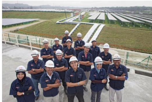
Cypark Renewable Energy Park

Cypark's overall commitment towards environmental sustainability is evidently demonstrated through Cypark's core business, generating renewable energy at remediated landfill sites by harnessing by-products from these sites (i.e. biomass, landfill gas) as well as transforming these sites into solar parks to produce sustainable green energy. In line with its core business services, Cypark has been initiating and supporting activities that increase awareness as well as develop skills and knowledge particularly on renewable energy and environment.