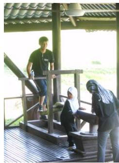
Making rice flour using traditional method

In an aim to make the event a sustainable one, all meals were served using food container and eco products as well as segregated organic waste and recyclables.