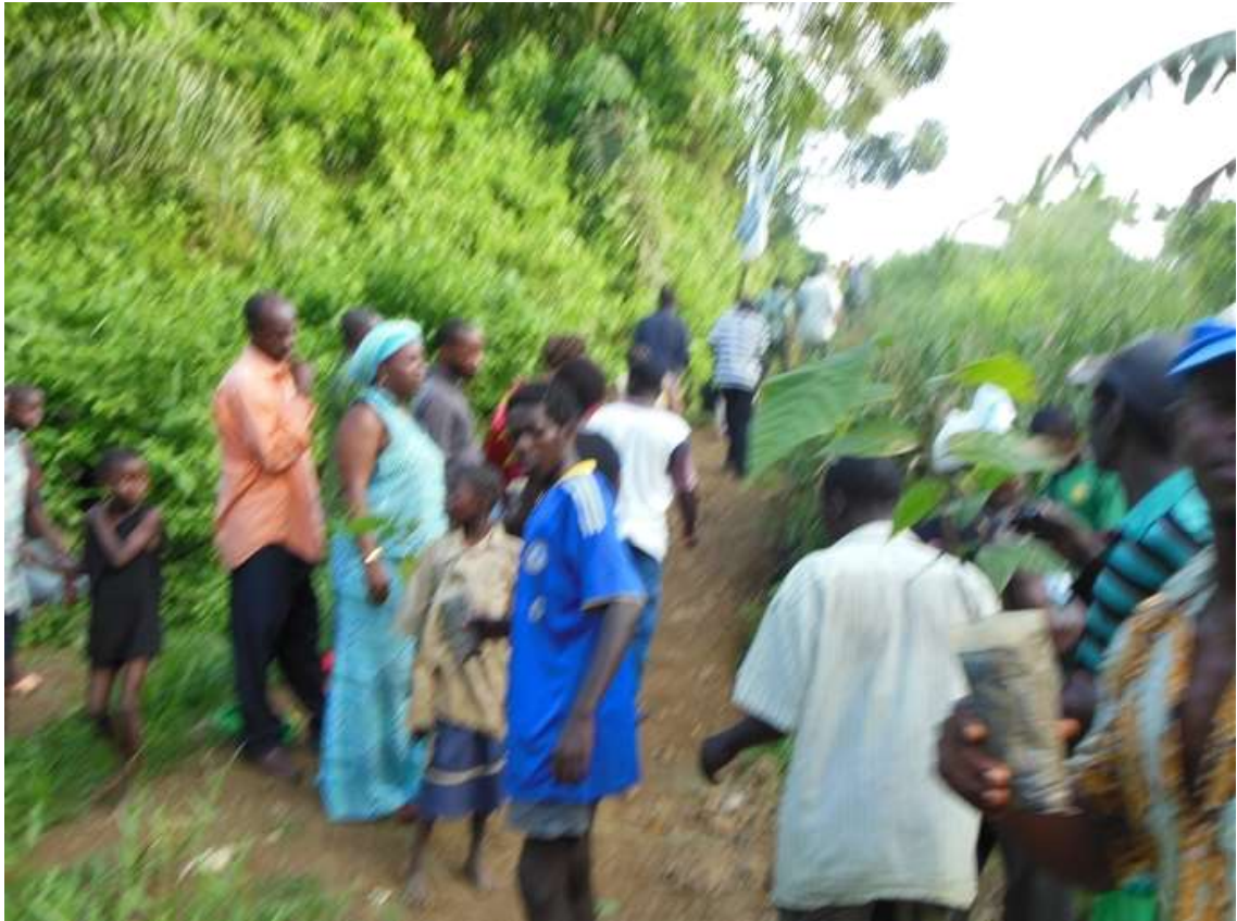
Departure to NURSERY and planting of economically rich trees and Endangered Species