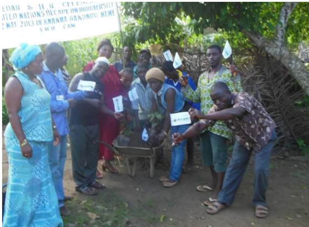
Distribution of Tree Nurseries for planting and Polythene Bags.