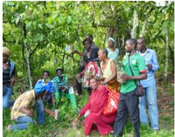
Tree Planting exercises.