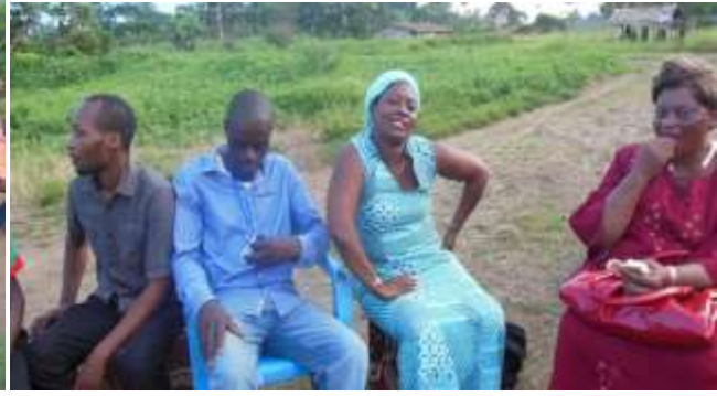
Assistant Director and Members.