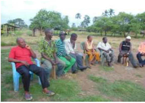
Members of Community Exchanging information