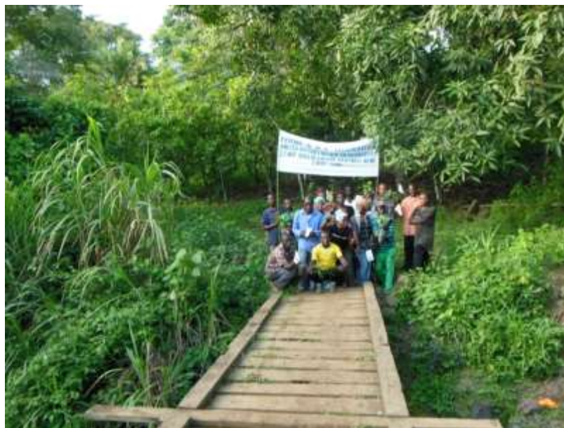
A Wood Bridge which assist communities transport agricultural produce from the Meme River Community Forests and Meme River Forest Reserve to the villages.