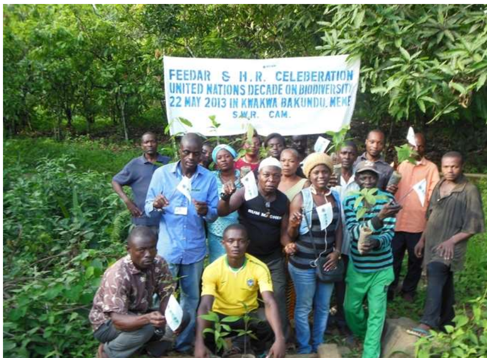
Community heads representing Farmers, CSOs, NGOs, Women, Churches, Youth Groups.