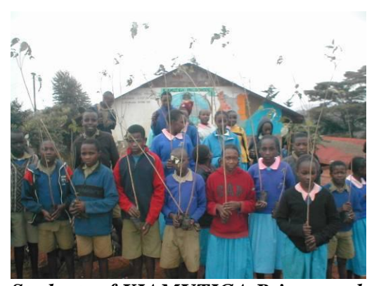
Students of KIAMUTIGA Primary school as they receive the trees