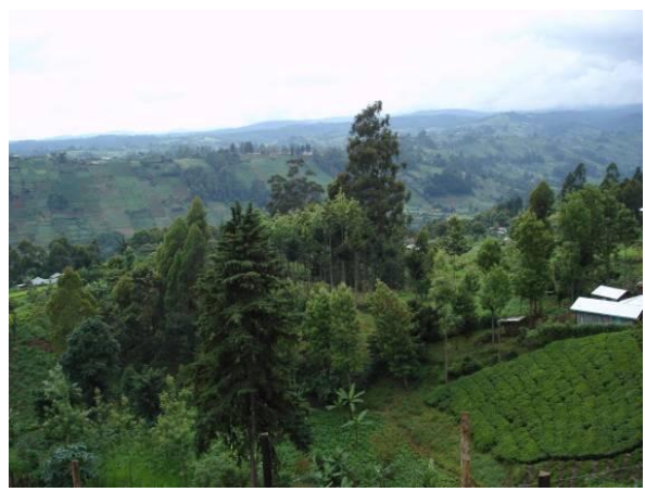
A picture of the eastern side of the Aberdare Forest showing tea farms and human settlement.