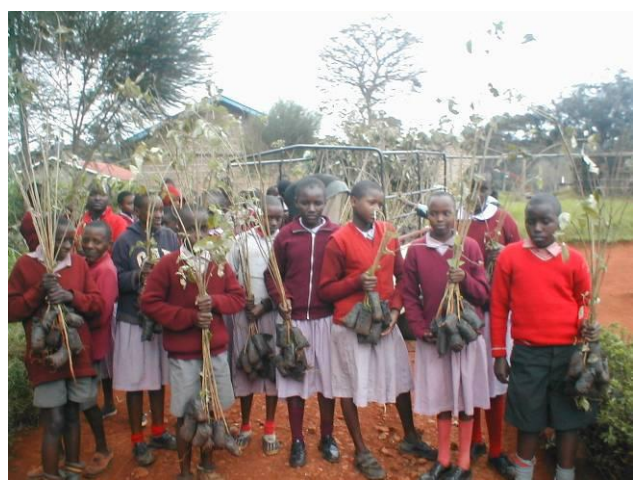
Students from WANDUMBI Primary school pose for a photo as they received the trees from KSEI