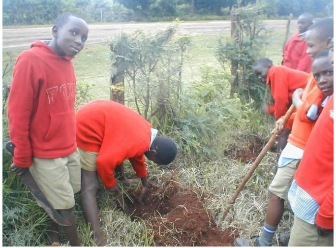
Students planting trees along the fence of the school compound.

Students from NDUGAMANO primary school collect trees from our nursery.