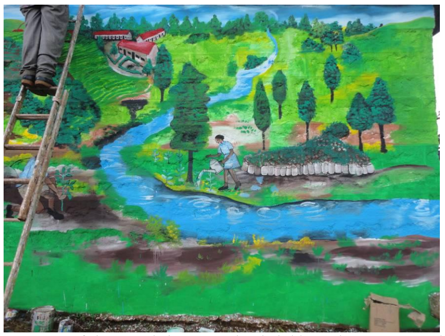
A section of the mural showing school children planting trees ad watering them and a tree nursery in the school compound. We can also see Tea farms in the distance on the right.