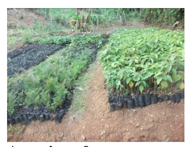
A section of our tree nurseries in Tetu.