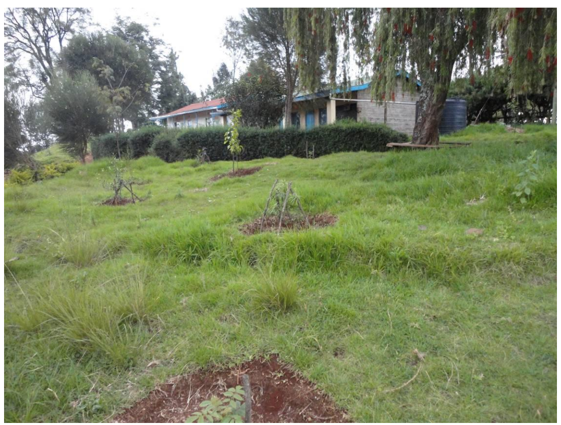
Trees planted in the school compound and donated by the local tree farmers.