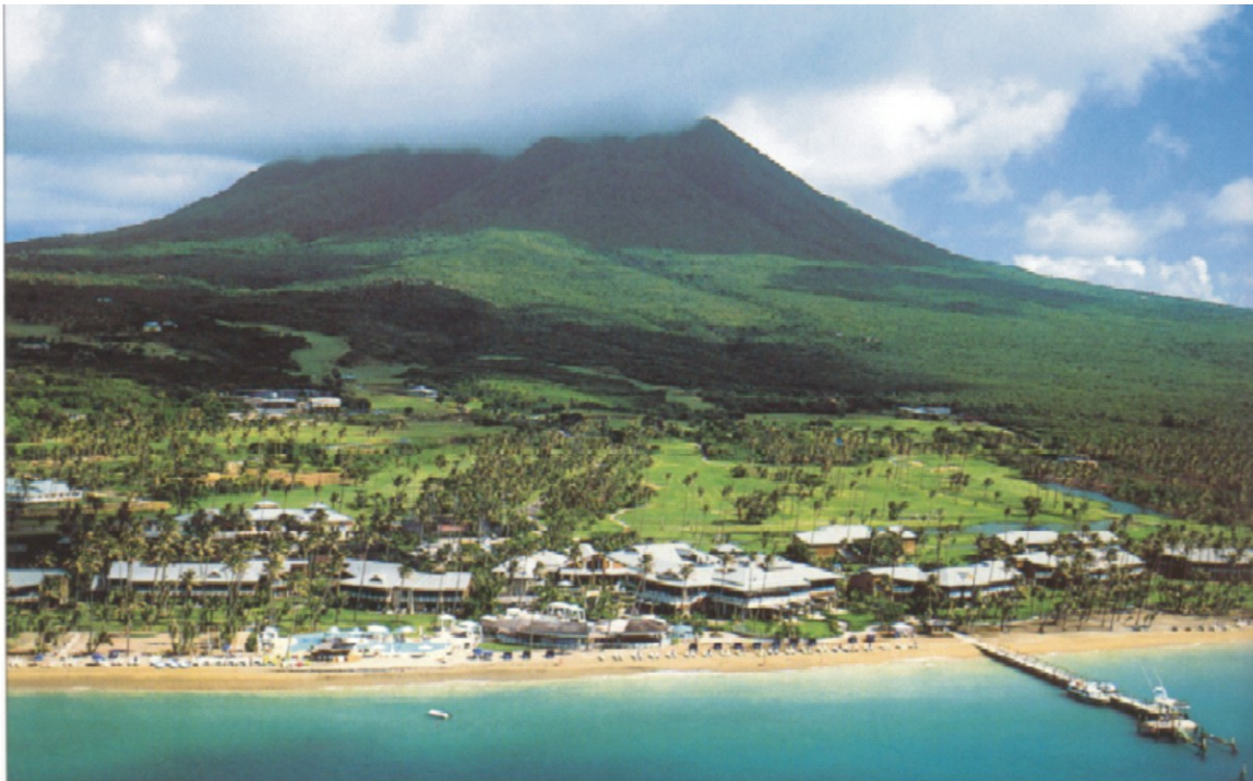
Figure 7: Four Seasons Hotel