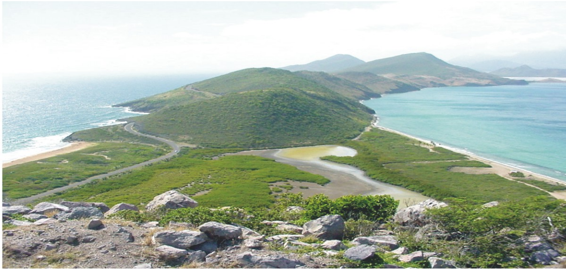
Figure 3: The South East Peninsula