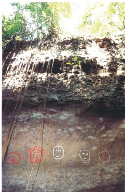
Figure 5: Carib Drawings at Dry River bed (St. Kitts)

The first inhabitants of the islands were pre-ceramic people called Sibonay. They are believed to have arrived about 2,100 years ago from Central America. The next people to colonise the islands were the Arawak who originated from the Orinoco River area in modern day Venezuela. They in turn were followed by the Caribs, again from South America.