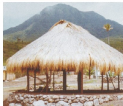
Figure 6: Replica of a Carib Dwelling (Nevis)

Christopher Columbus landed on the larger of the two islands in 1493 on his second voyage and named it after St. Christopher after his patron saint. Columbus also discovered Nevis on his second voyage, reportedly calling it Nevis because of its resemblance to a snowcapped mountain (in Spanish, "nuestra senora de las nieves" or our lady of the snows). European colonization did not begin until 1624, when the first English, then French colonists arrived on St. Christopher's Island, whose name the English shortened to St. Kitts. Within the first decade of European settlement, Africans were taken from countries such as present day Senegal, Nigeria, Congo and Angola, to name a few, to provide slave labour for the cultivation of sugar cane. By 1700 the African population significantly outnumbered the Europeans.