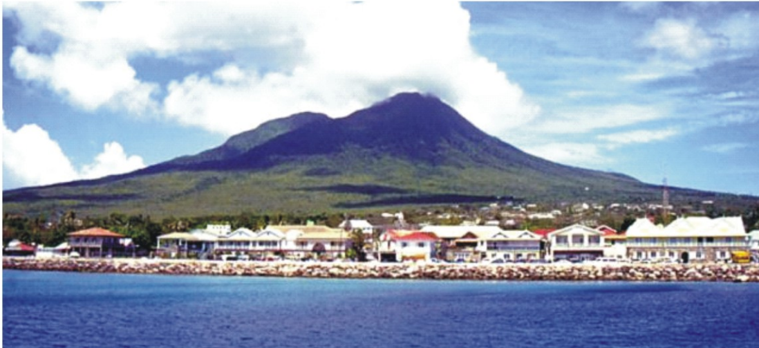
Figure 4: Nevis Peak

Nevis lies along a parallel of the inner volcanic arc of the Lesser Antilles and is comprised of nine distinct volcanic centers. The central Nevis Peak, see Figure 4 , is the most imposing of these centers with an altitude of 985m (3,232 ft.), giving the island a conical appearance. Round Hill (Windy Hill) to the north climbs to 309m (1,014 ft.) with Saddle Hill in the south rising to 381m (1,250 ft.). The other subsidiary peak of note is Butlers Mountain 578m (1,896 ft.) which thickens the range lying to the east of the island.