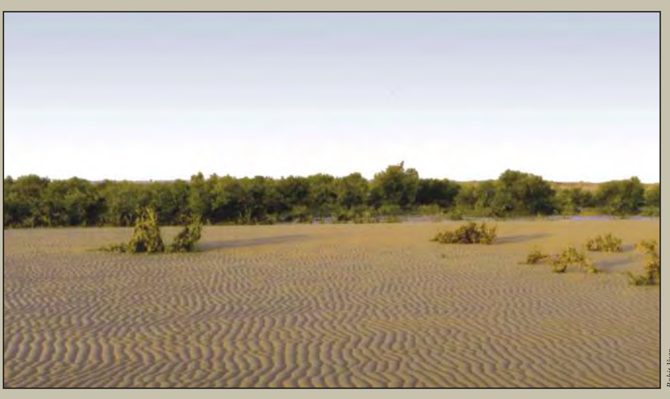
Several of the marine and inland water ecosystems have been brought under the PA network; more efforts are needed to establish and effectively manage the marine PAs and adequately protect inland water ecosystems.