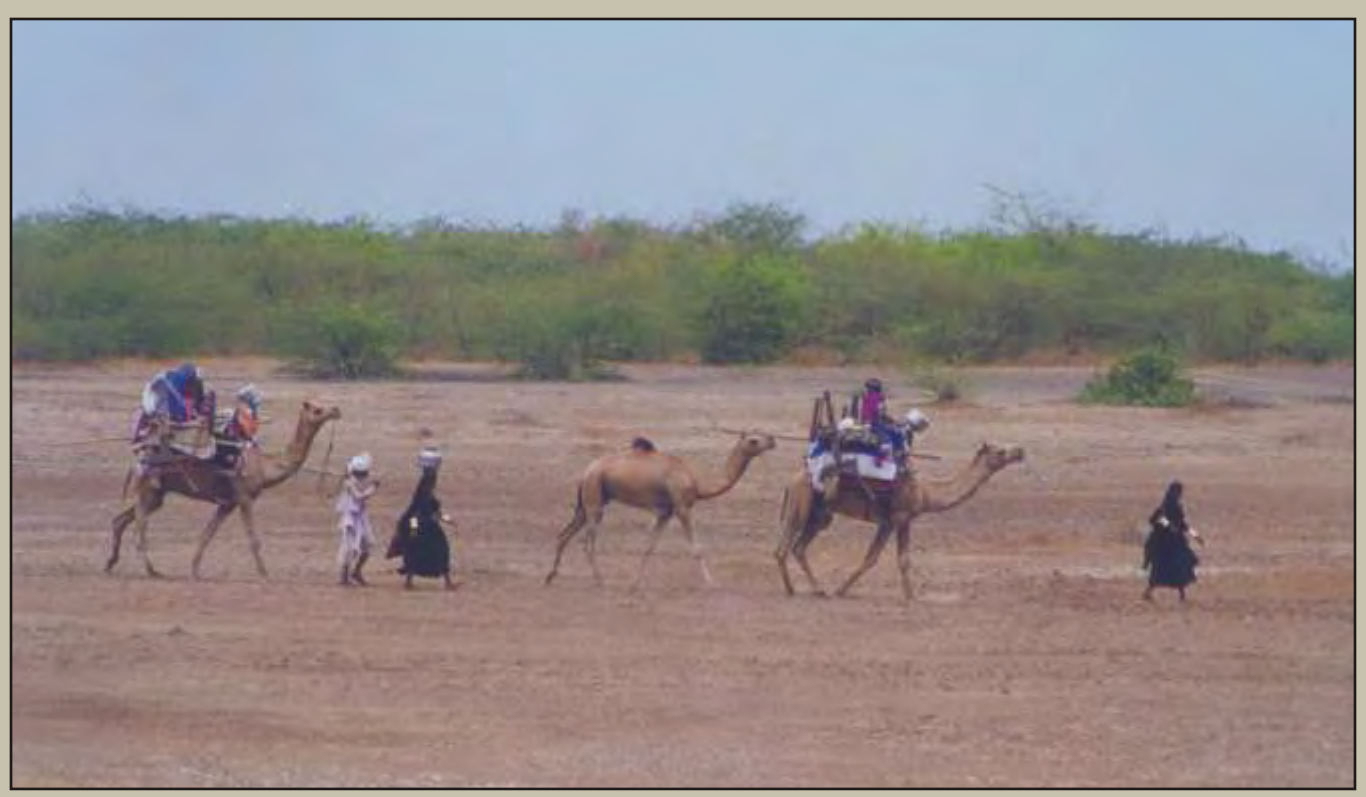
'Ship of the Desert'. Camels (Camelus dromedaries) are used as beasts of burden and also provide humans with milk, meat, wool, leather, and fuel from dried manure.