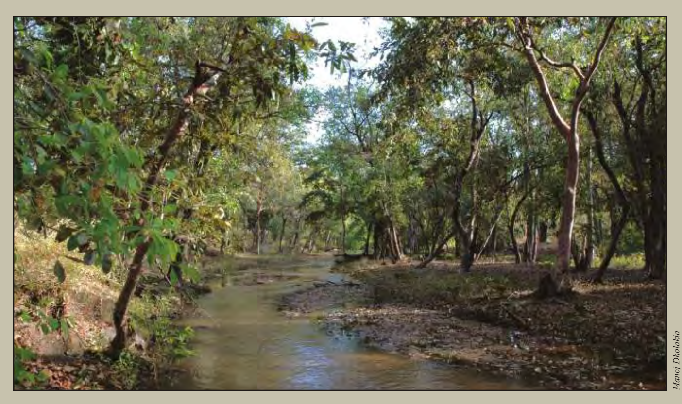
Streams are an important component of the water regime of a forest; also, many of our rivers originate in forests.