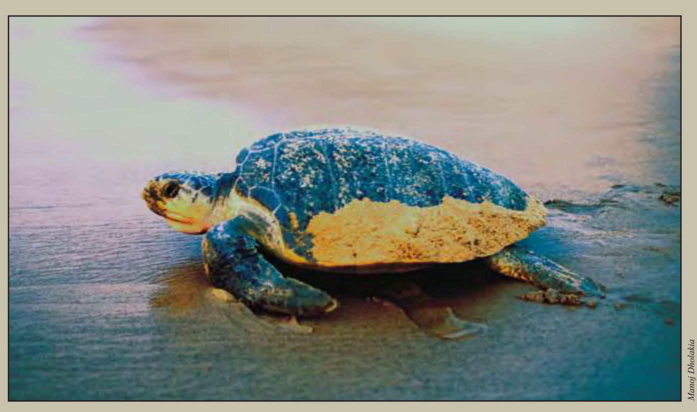
Olive Ridley Turtles in several hundred thousands nest on the Gahirmatha beach, Orissa. It is the world's largest known sea turtle rookery.