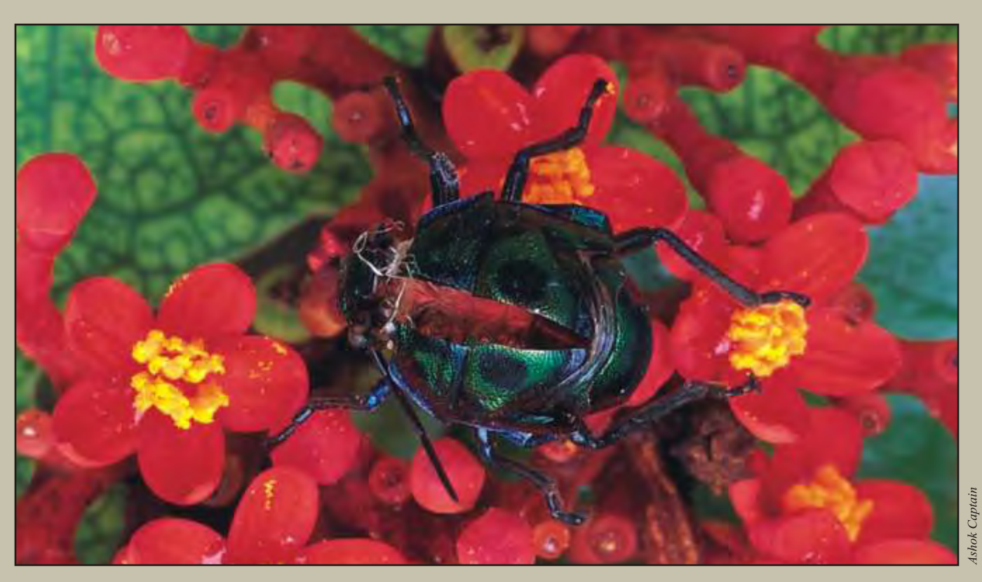
Beetle feeding on flowers