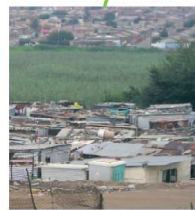
Johannesburg, South Africa