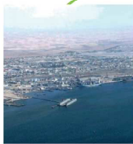
Walvis Bay, Namibia