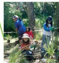
Waitakere, New Zealand

ICLEI Local Governments for Sustainability