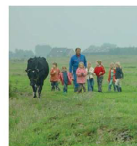
Amsterdam, The Netherlands