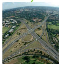
Ekurhuleni, South Africa