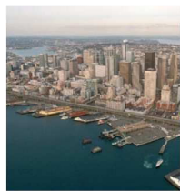
King County, U.S.A.