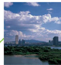
Seoul, South Korea