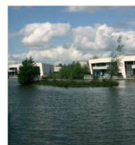
Tilburg, The Netherlands