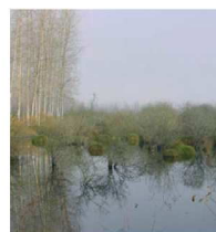
Île de France, France