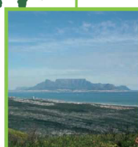
Cape Town, South Africa Host City of ICLEI Africa Secretariat