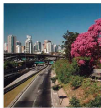
São Paulo, Brazil