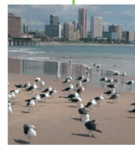
Durban, South Africa