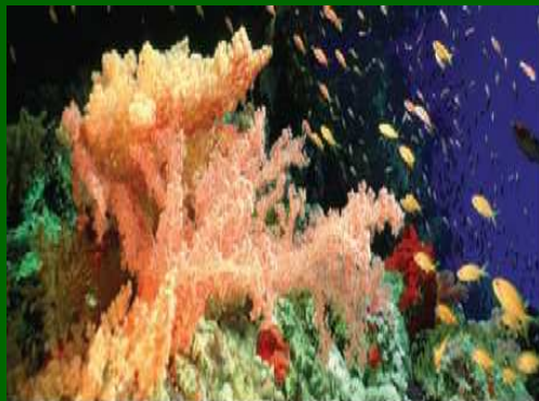
Marine & Coastal Biodiversity