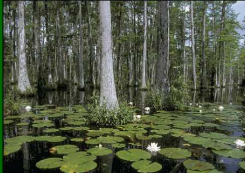
Inland Waters Biodiversity