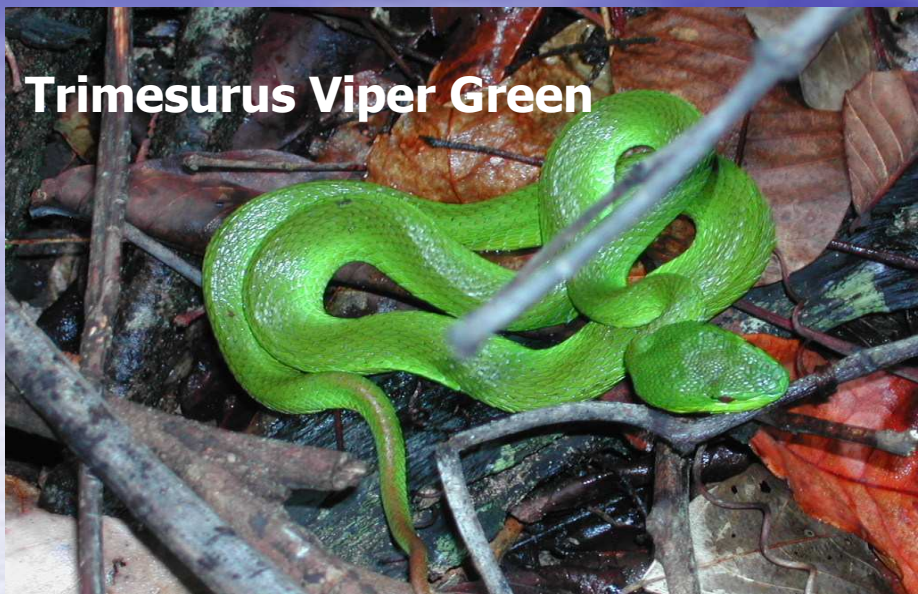
Trimesurus Viper Green