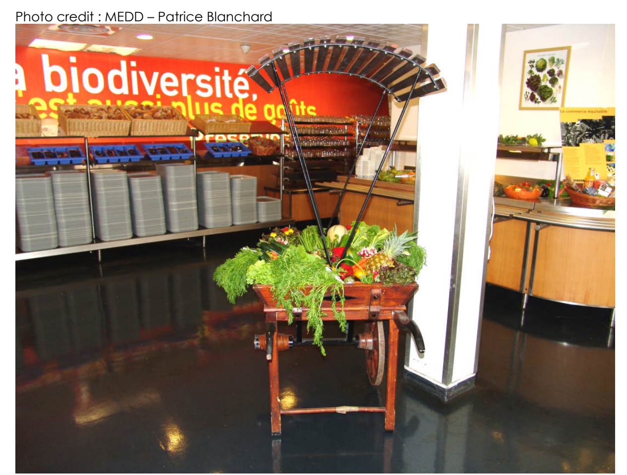
"Biodiversity conservation means tastier foods", the restaurant chef agreed 100 %.