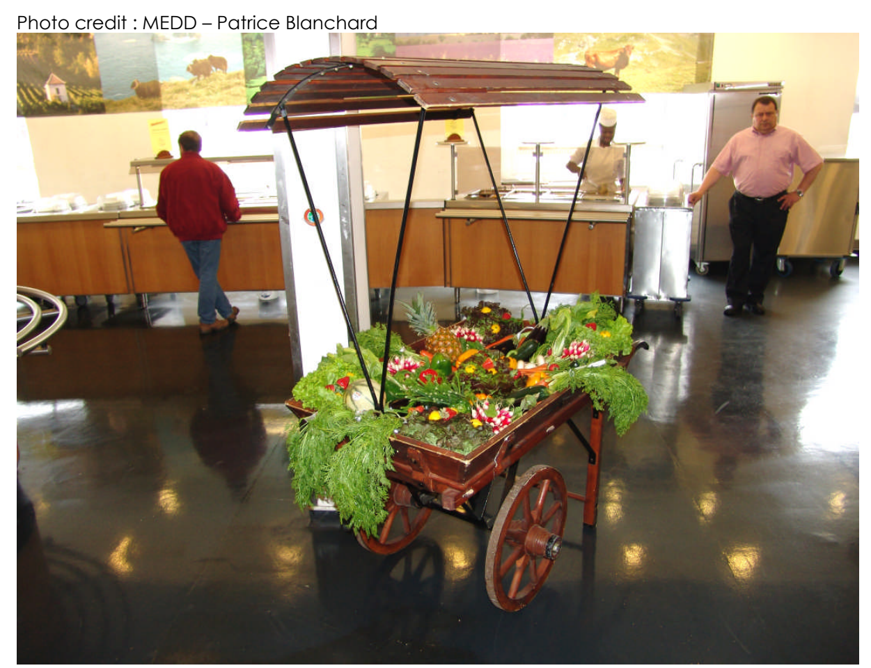
The staff of the ministry's restaurant welcomed guests for lunch with a freshly decorated biodiversity cart.