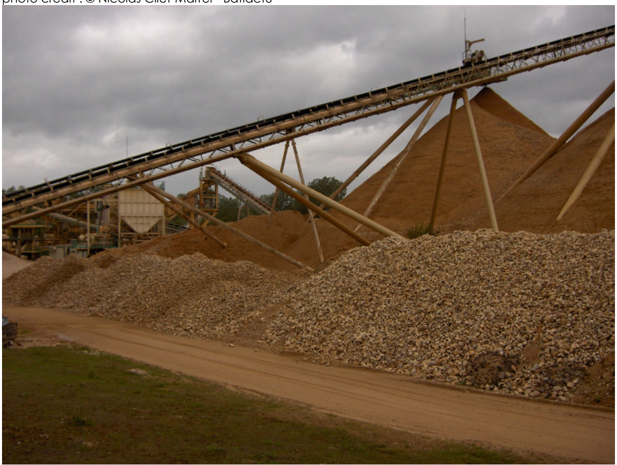
The Minister visited Lafarge Granulats located in Sandrancourt where the firm stands for a pioneer in terms of biodiversity.