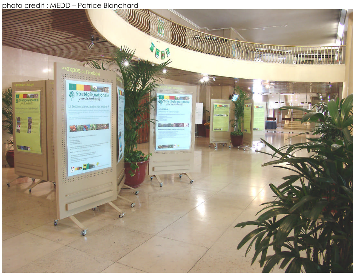
The exhibition went on through the sustainable development week- 29th May to 4th June.