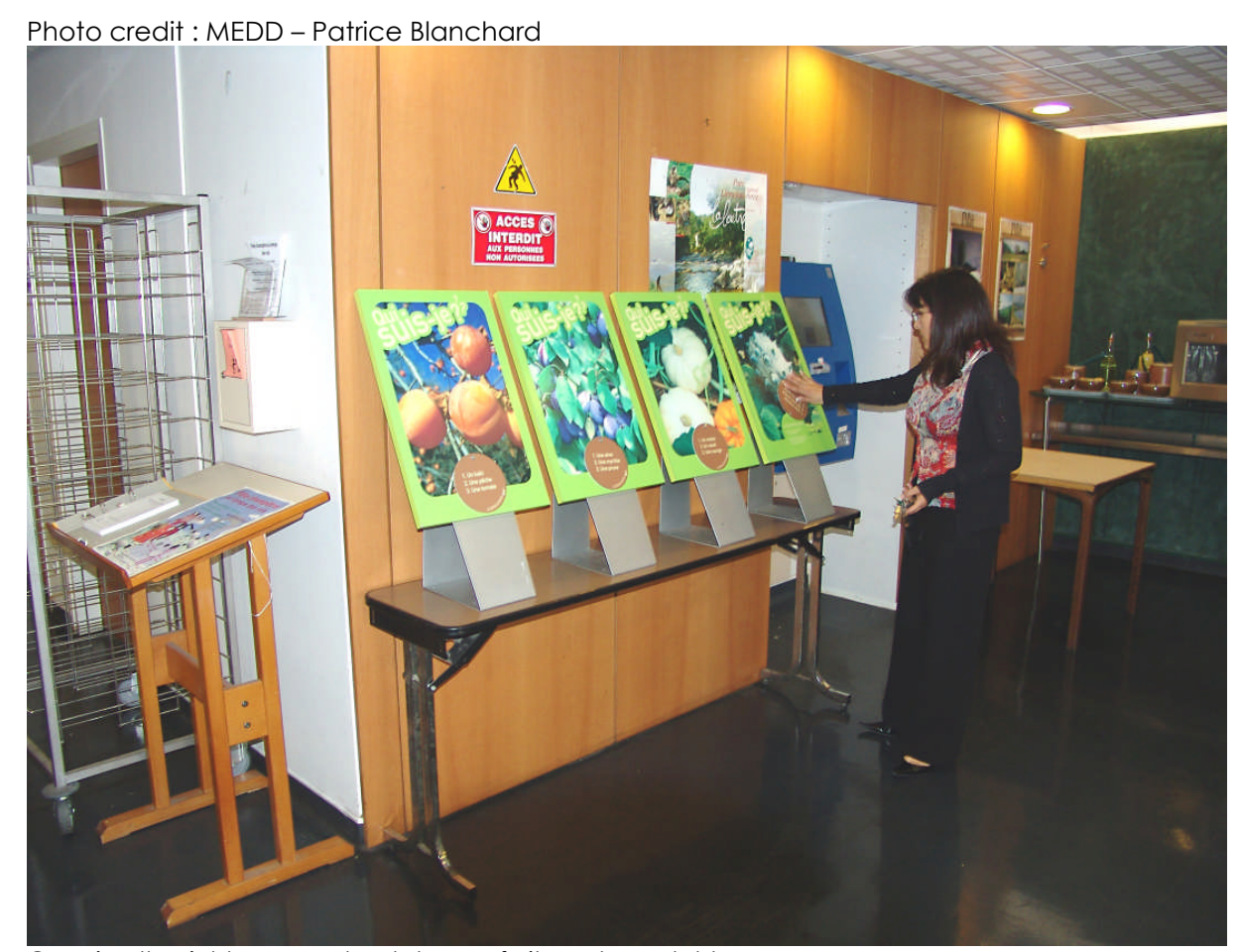
Guessing the right answer about strange fruits and vegetables.