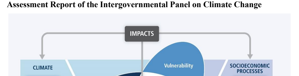
Figure 3. Illustration of the core concepts of the contribution of Working Group II to the Fifth