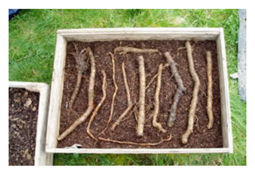
The roots can be placed quite close together in the boxes.