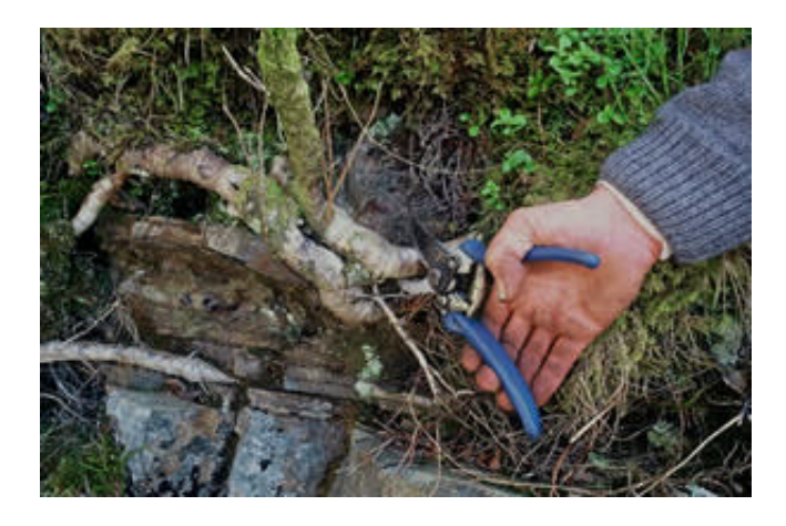
Exposed roots can be cut with secateurs. Note the suckers growing out of the root to the left of the secateurs.