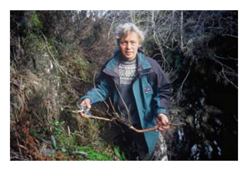
In this example, the root has several suckers growing out of it.