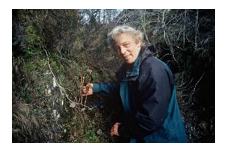
Aspen roots exposed and ready to cut.