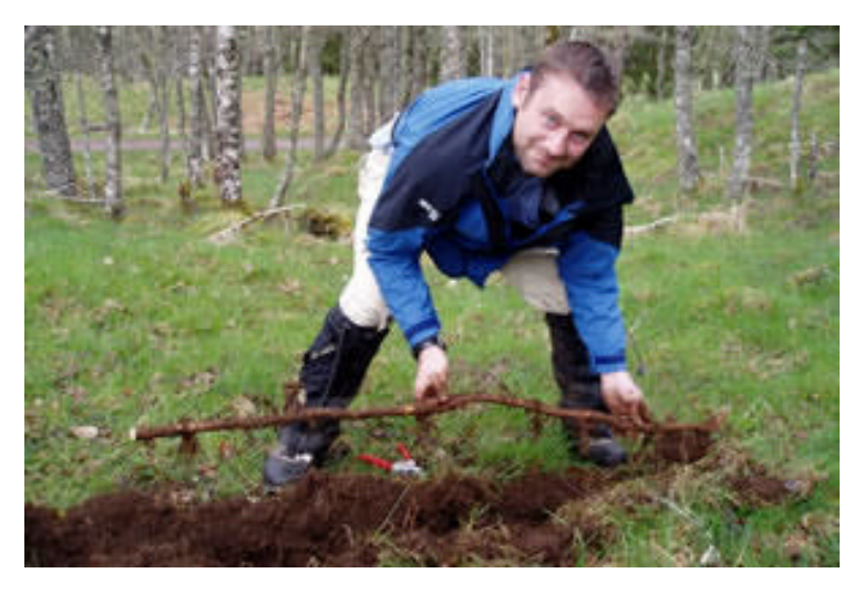
Sometimes it's possible to collect a long section of a single root.