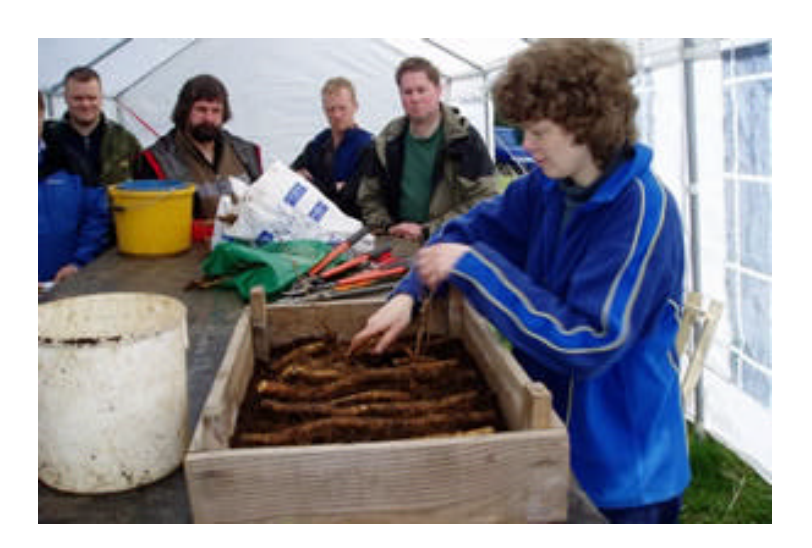
Once they have been cut to the correct length, the roots are placed on compost in boxes. Some of these roots have suckers growing out of them.