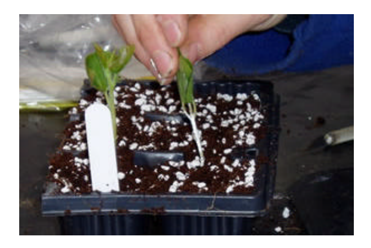
This cutting has been dipped in a rooting compound (which gives the stem the white colour visible here), and is being planted in a Perlite and compost mixture.