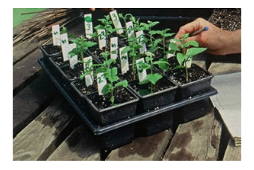
In this tray of planted cuttings, each plant has been labelled to indicate the date and the site where the originating roots were collected.