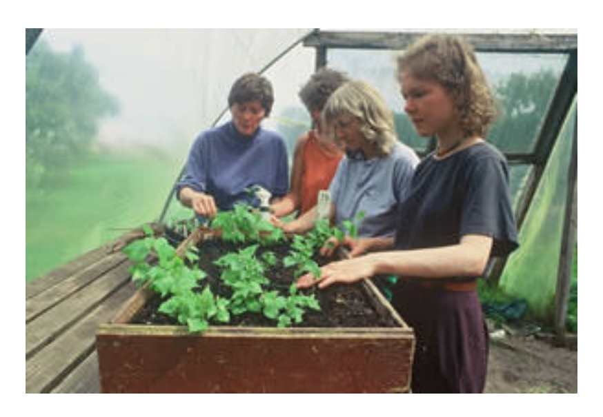
After a few weeks the roots send up vigorous new suckers.

When covering the roots with compost, any suckers (as in the back of the box in this photo) should be left sticking up above the compost.