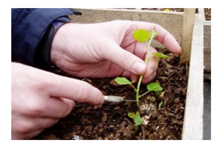
The suckers are severed near where they emerge from the parent root.