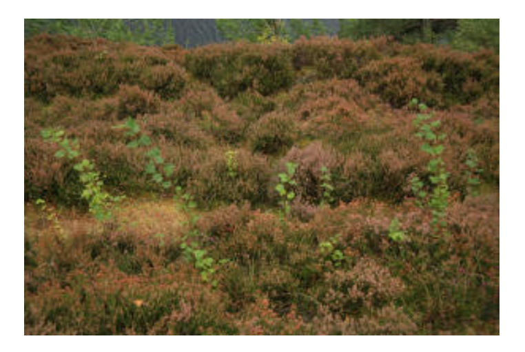
Lines of suckers such as this indicate the location of aspen roots. These are obviously easiest to spot when the suckers have leaves on them, so their location should be scouted out in the summer prior to when roots will be collected.