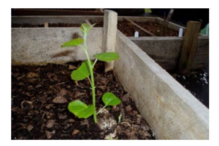
This sucker is the right size to cut and root as a separate plant.