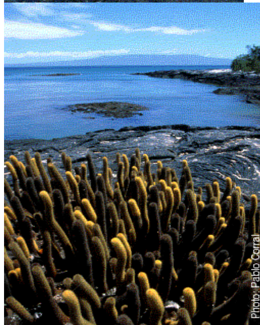
Cactus on lava field Isabela Island, Galápagos, Ecuador