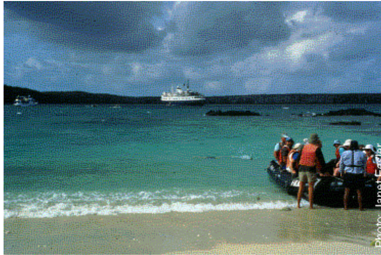
Galápagos tourists - beach landers Galápagos