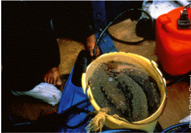
Sea cucumber fishing Isabela Island, Galápagos, Ecuador