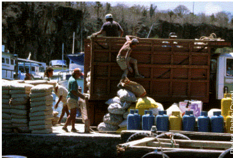
Sacks of cement unloaded at the harbour of Isabela Island Galápagos, Ecuador

Population growth is considered one of the main problems for conservation in Galapagos. From 1982 to 1998, population growth was approximately 6%, principally due to in-migration (Galapagos Report, 1998: 30). The number of inhabitants on the Islands more than doubled in the last ten years and now exceeds 16,000 (Galapagos Report, 1999: 28). The growing mobility of people and materials between Galapagos and the mainland and among the islands themselves (by plane as well as by fishing, tourist and cargo boats) threatens the isolation of the Islands, the most important condition that has permitted the development of unique evolutionary processes. In addition, individuals migrating from the mainland to the Galapagos often bring attitudes that are incompatible with conservation.