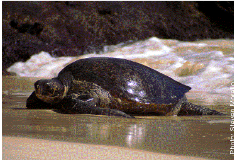
Green sea turtle on beach Galápagos Islands