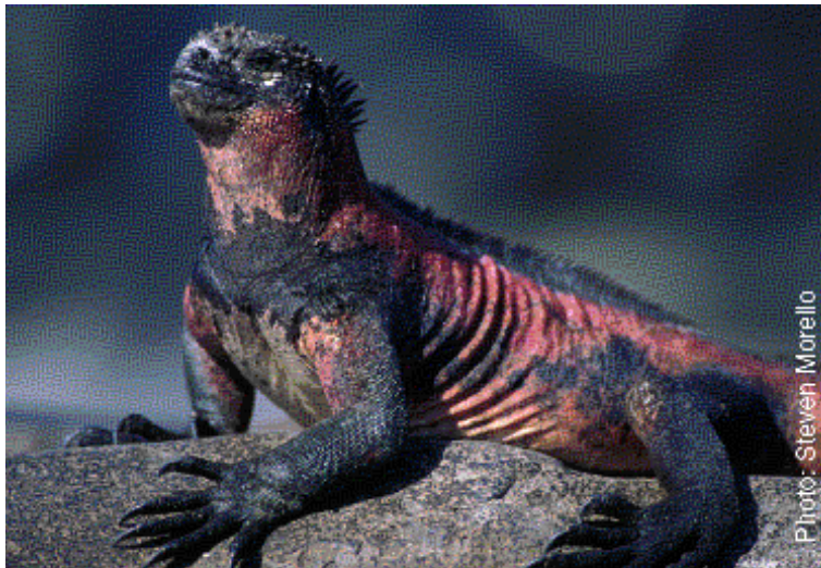
Marine iguana resting Galápagos Islands

The Galapagos are active volcanic islands only a few million years old. They