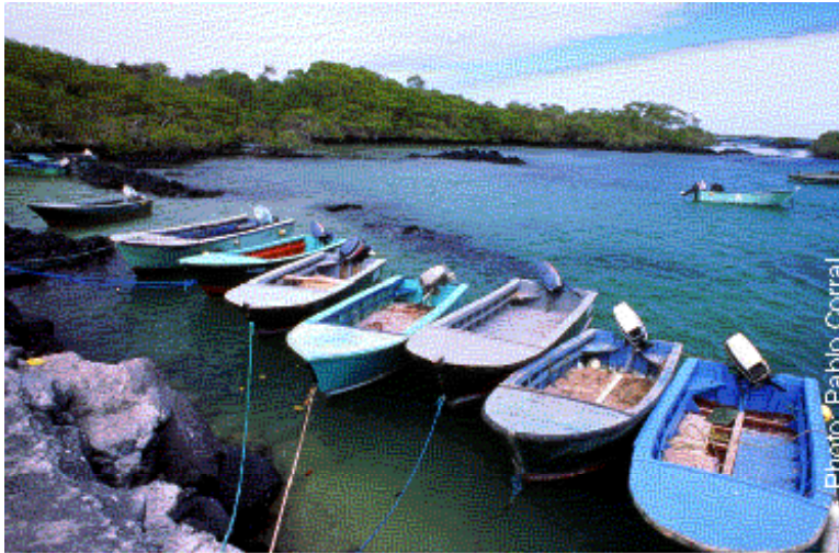
Fishing boats anchored in Isabela Island harbour Galápagos, Ecuador