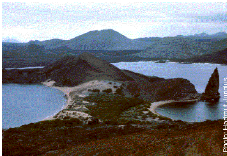
Bartolome Island Galapagos

Finding a way to honor both private and public values of biological diversity requires dialogue between stakeholders and consideration of values that cannot be quantified. Given the current, insufficient state of knowledge about biological processes, a certain margin of safety, in accordance with the precautionary principle, is critical. Galapagos is not only valuable for its fishery resources and the tourism revenue it generates, it is a treasured and unique part of our world heritage that gives us pleasure through the pure knowledge of its existence. As we look to the future, we must evaluate our efforts and be ready to adapt and innovate to meet new and old forces that threaten the preservation of the enchanted Galapagos Islands and other world treasures.