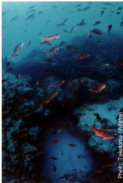
Marine life of Galápagos

The Galapagos archipelago is situated at a point where major ocean currents converge, mixing nutrient rich cool waters from the south, warm currents from the north, and a deep cold current from the west. Climatic conditions are