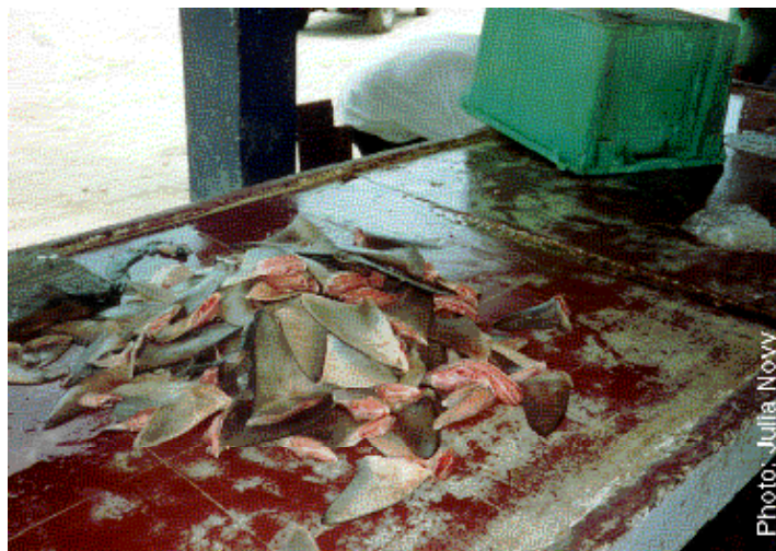
Shark fins on display at a market near Guayaquil, Ecuador

Since aerial patrols made it possible to bring into force the regulations limiting sea cucumber fishing, many illegal fishers transferred their effort to the equally profitable, but less risky, illegal shark fin business. Sharks are fished by night from small boats. By dawn, there is no evidence of illicit activity. Both the illicit product and the equipment to catch it are easily hidden along the coastline, making control more difficult. In contrast, sea cucumber harvesting requires making encampments to process the sea cucumbers (adding the risk of introducing exotic species to pristine land areas of the park). With aerial patrols, these camps became relatively easy to locate and evacuate.