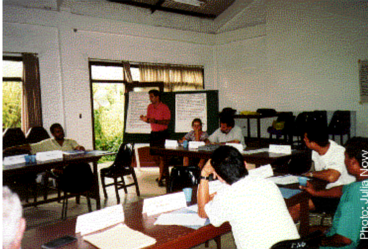
Fisheries certification workshop in Puerto Ayora, Santa Cruz, Galápagos

National Park Service. The aim of the workshop was to provide information on the Marine Stewardship Council and the certification process, and to explore with stakeholders the potential benefits of and challenges posed by fishery certification