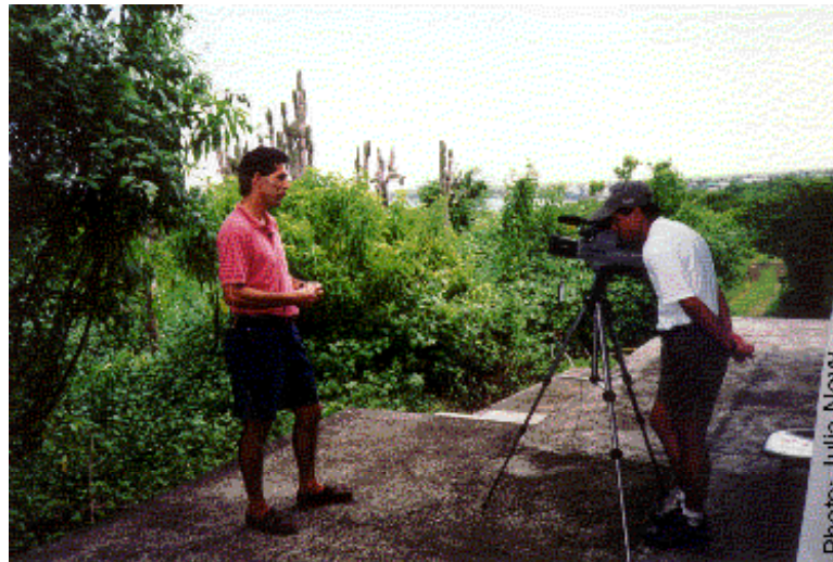
Local press for fisheries certification workshop Puerto Ayora, Santa Cruz, Galápagos

result in economic benefits. If, for example, lobster fishers consistently employed a more selective gear (rather than spearing), they could reduce the number of egg-bearing females and undersized individuals taken, and bring the fishery in closer conformity with certification requirements. In addition, this could significantly increase the value of lobster by improving the quality of the meat. Meat from lobsters that have been speared tends to deteriorate more quickly than meat from whole individuals. To identify market opportunities for certified products, WWF representatives and hired consultants carried out dialogue with potential buyers of certified products from the Galapagos, including locally based tour boats and seafood importers in the United States.