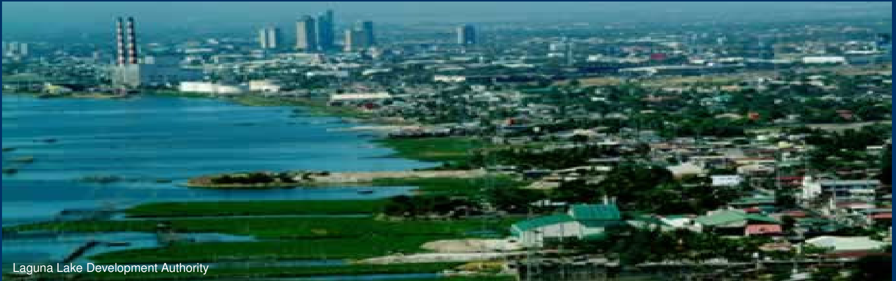
Laguna Lake Development Authority