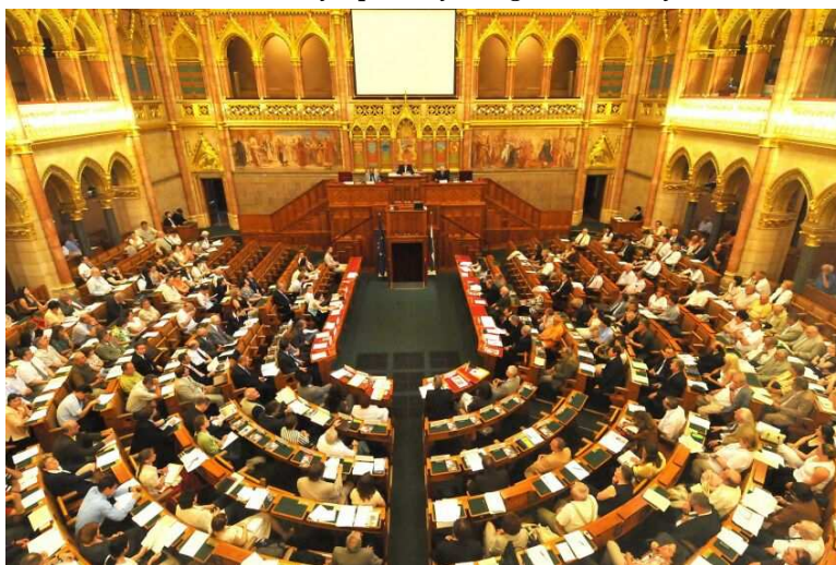
Parliamentary Open Day on agrobiodiversity

The International Biodiversity Day was celebrated at the most prominent place, the Parliament of the Republic of Hungary through a Parliamentary Open Day focusing on agro-biodiversity, namely the conservation of local varieties and the diversity of national crop and animal genetic resources. Approximately 500 people participated on the event including all relevant stakeholders, among others high-level representatives from state administration as well as Members of Parliament, scientific and research institutions and NGOs. The participants adopted recommendations on the conservation of Hungary's genetic diversity, which is planned to be presented to the Parliament in order to approve a decree on this important issue. More details (in English): http://www.essrg.hu/parlament/programen.html