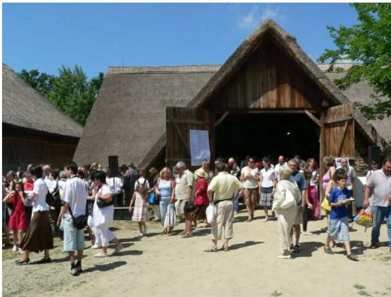
Venue of the award ceremony of the biodiversity weekend

On the occasion of the International Biodiversity Day a beautifully illustrated 2-volume fairy-tale book titled “Are there still any sky-high bean stalks at your village?” was launched by the Ministry of Environment and Water, containing the best 163 agrobiodiversity-related tales written and painted for the competition. This book is a perfect tool for environmental education; therefore the main libraries and all eco-schools will receive a copy. It will also be available at bookstores.