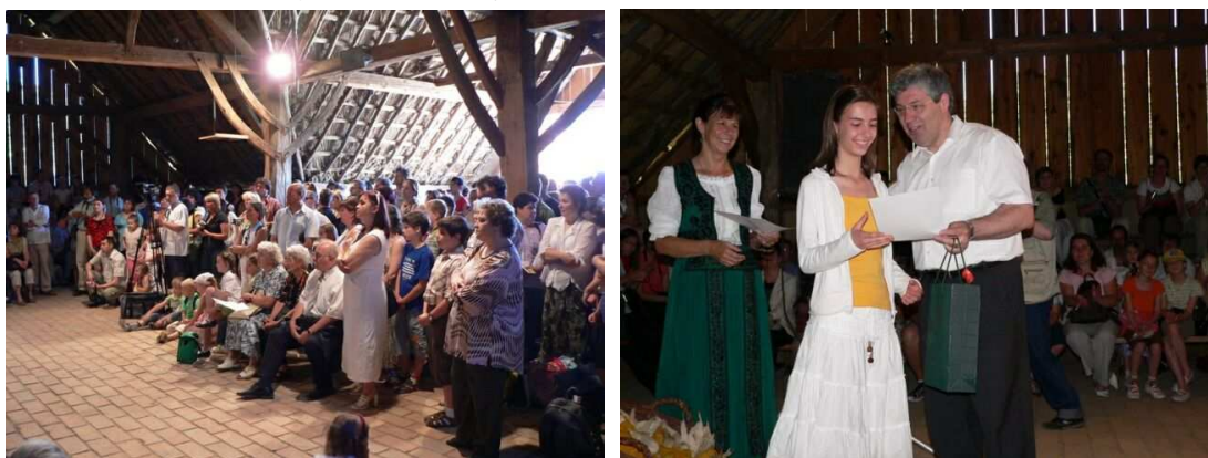
Handing out the books to the winners of the competition launched on the International Biodiversity Day