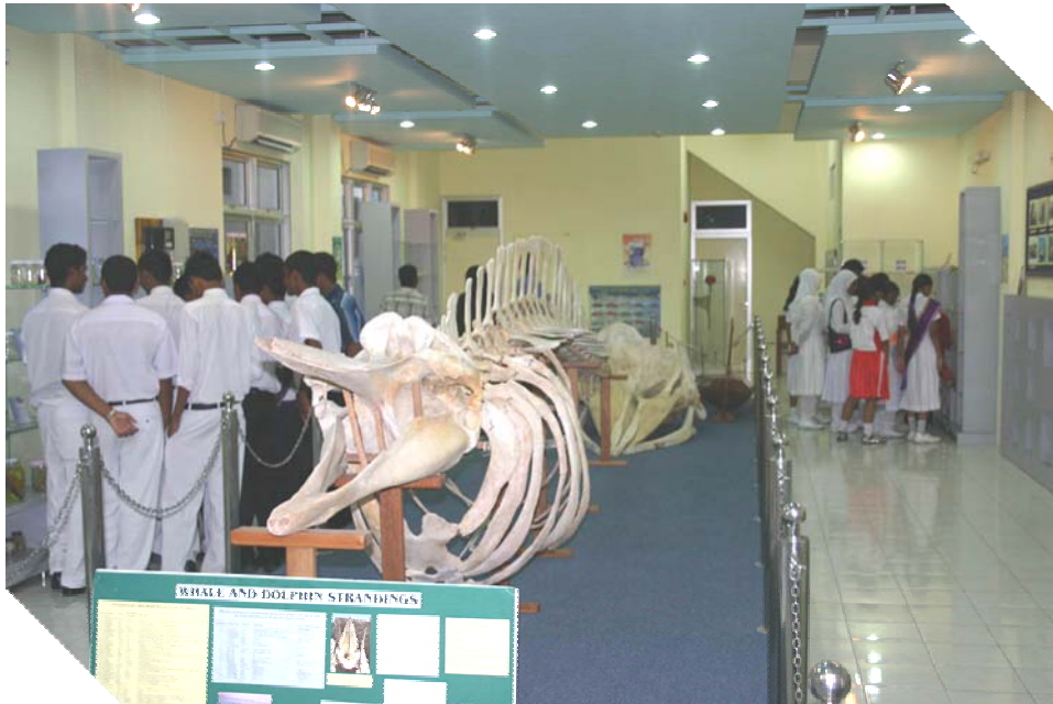
(Students in the museum)

A marine museum tour was organized for school children on the afternoon of 22 May 2007. Students were taken to the marine museum of the Marine Research Centre, to show the fishes and marine animals on display and to explain about the species of fishes and corals found in the Maldivian reefs.