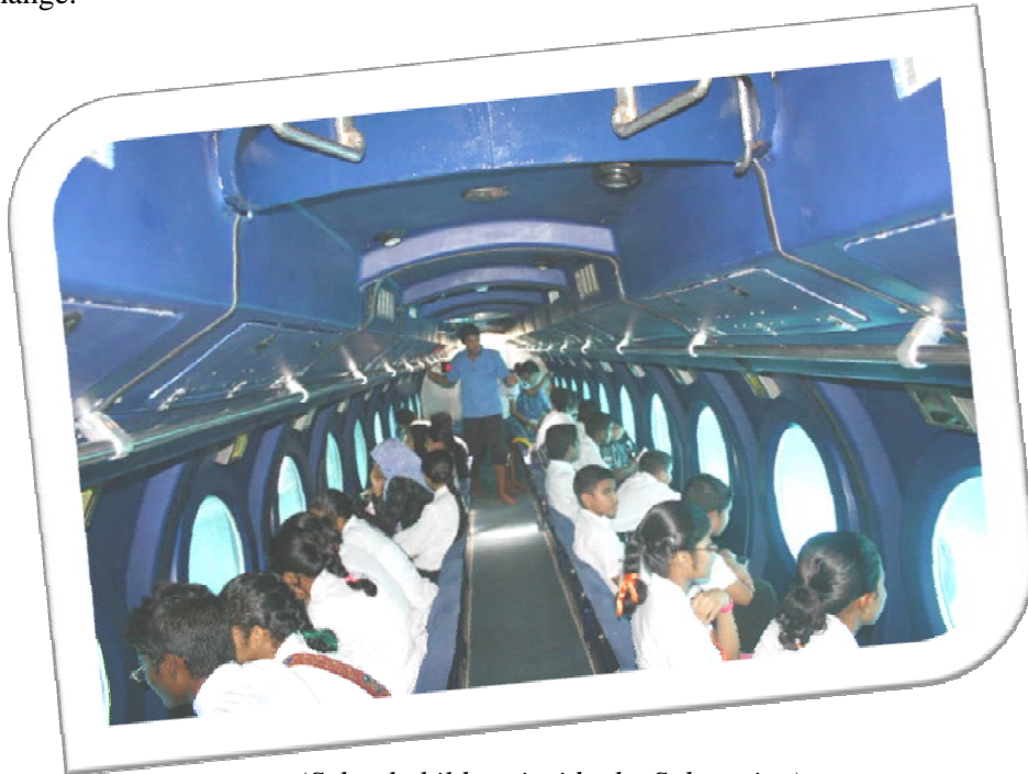
(School children inside the Submarine)

The Environment Research Centre organized a reef sight-seeing tour in Tourist Submarine for school children on the morning of 22 May 2007 in the capital island, Male'. The purpose of the trip was to show the children the diversity of the coral reefs and explain about the vulnerability of the reef ecosystem to climate change.