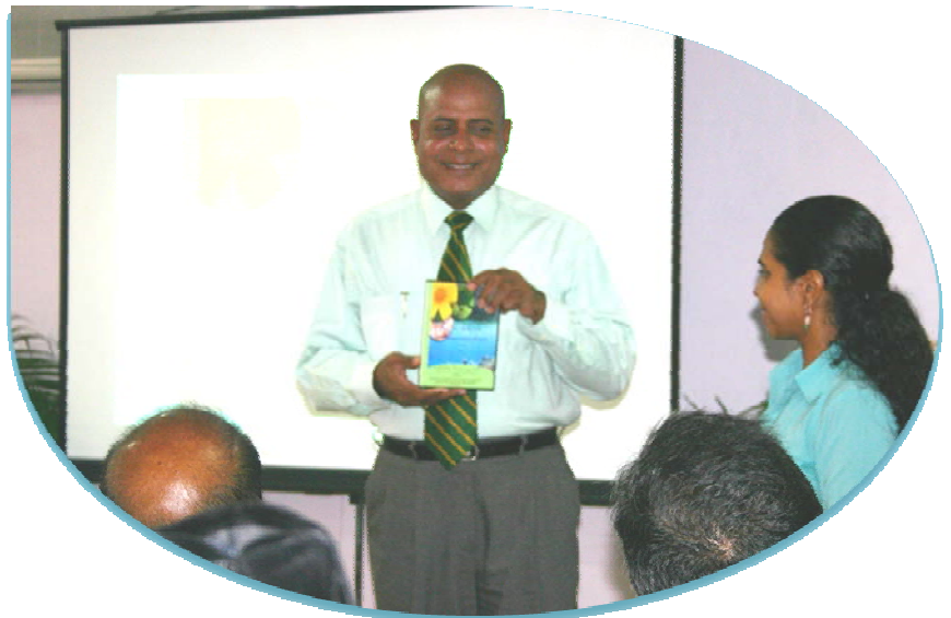
Minister of Environment, Energy and Water releasing the video song

A special video song made by the Acting Minister of Higher Education Abdul Rasheed Hussain, with a plea to leaders and elders to join hands to save the environment and the biological diversity was also released. The song appealed to listen to the cry of the world, listen to the world's plea, and to look at the environmental crimes and bring about justice to environment.