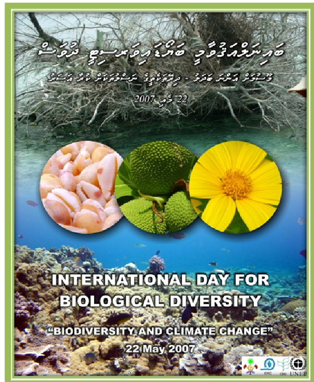
Biodiversity Day Poster

The activities linked with Biodiversity day this year are specially targeted to school children who will in future play an important role in taking steps to conserve the biological diversity of our country and also create public awareness on biodiversity issues.