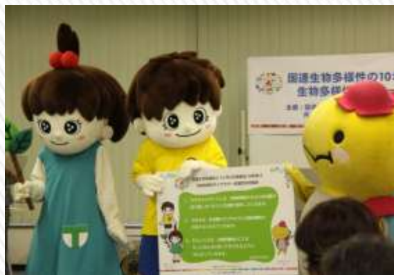
Joint declaration with Mascot character supporter's