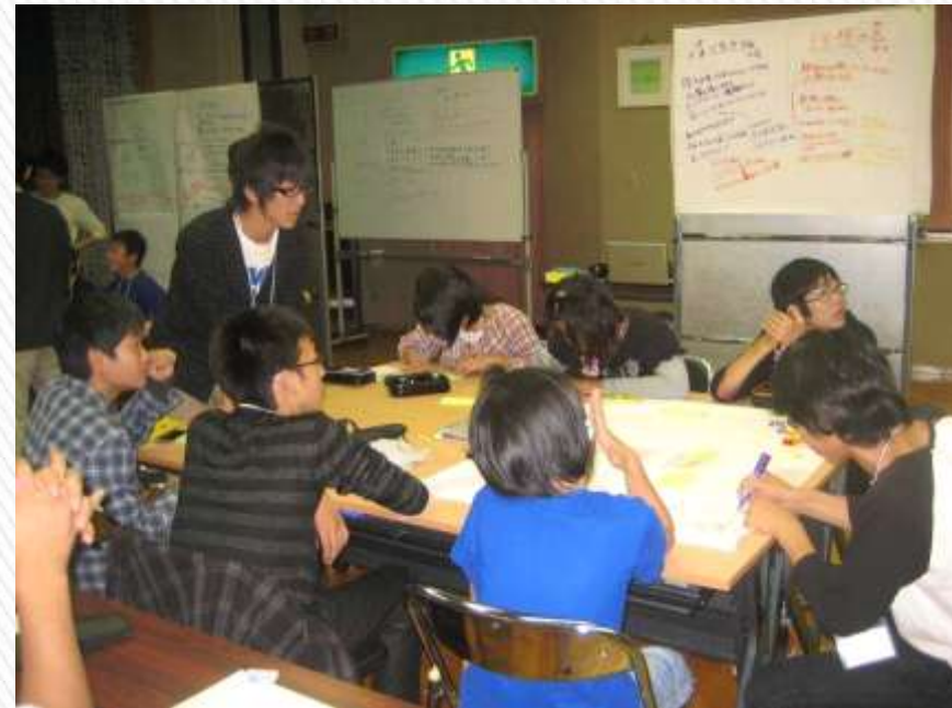
the Youth conference on Biodiversity by future generation

http://profile.ameba.jp/by-kodomo-cop10-members/