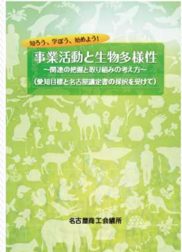
Guidebook 『Business activities and Biodiversity』

http://www.meisho-ecoclub.jp/special/biodiversity